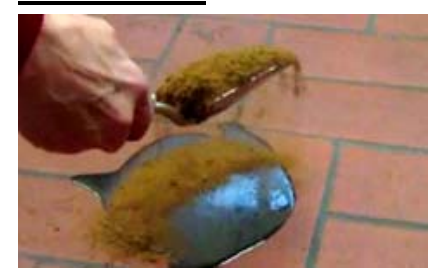
Pour Ristosorb® on the oil leakage - it will absorb completely in just a few seconds